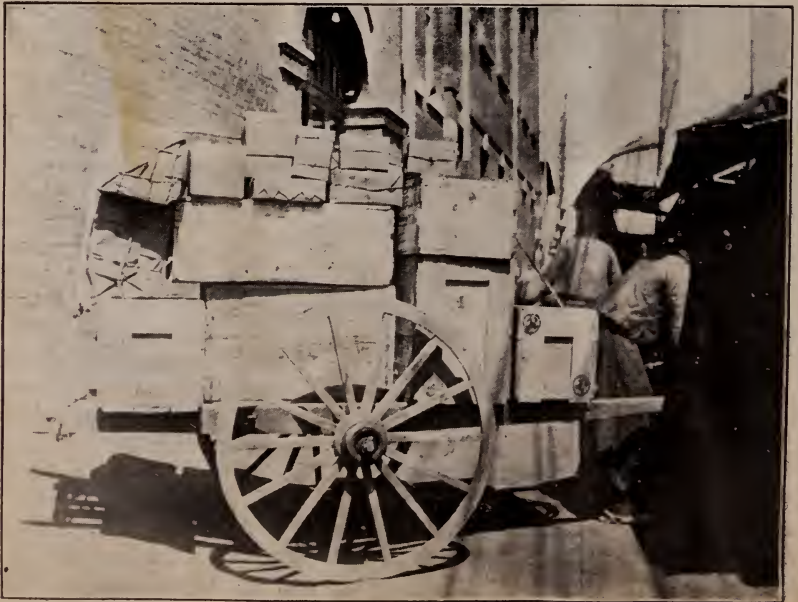
Scriptures Leaving Bible House.

Thus the Bible Society tries to sow beside all waters by making it possible for the missionary to keep a stock of Scriptures on hand which is delivered in his study free of all charges, and which he pays for when the books are sold, after deducting a discount to cover any losses or for